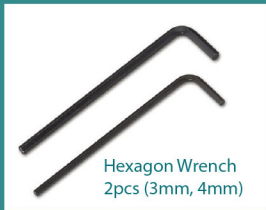
Hexagon Wrench 2pcs (3mm, 4mm)